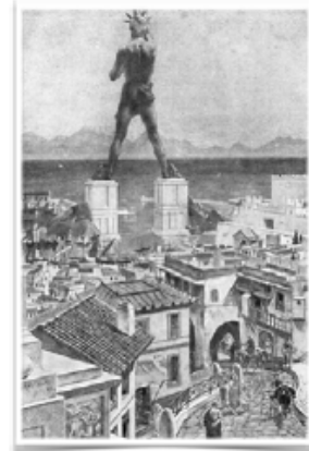
Artist's impression of the Colossus on Rhodes, built in 280 BC

It was during this period that the Colossus was built on the island of Rhodes. It was an impressive statue, said to be almost 50 metres tall (including the platform). It stood for 54 years until it was destroyed during an earthquake.