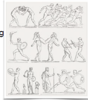
Illustration of Greek athletes at the Olympic games

Pythagoras, a Greek mathematician, was born in this period. His theories are still used in mathematics today, including the Pythagorean theorem about right-angled triangles.